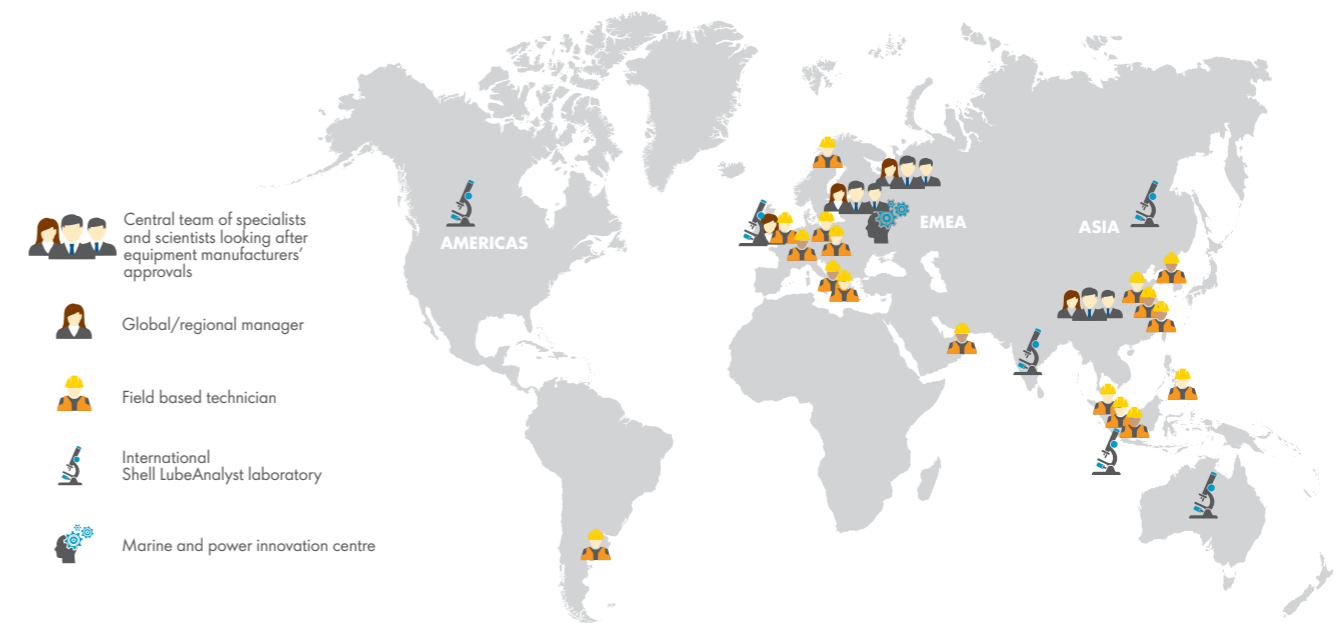
FIGURE 1: Shell Marine has teams of experts in strategic locations around the globe.